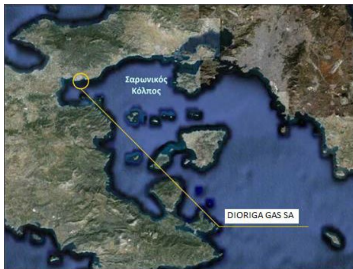
Figure 1 Dioriga FSRU Location